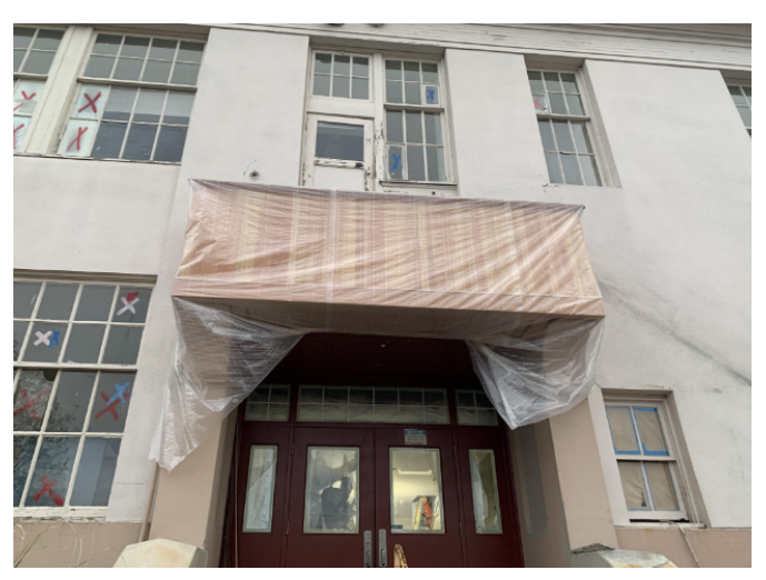
West Balcony Exterior Framing

Next, we will continue with the glass replacement for the window restoration, install flooring on levels 1 and basement, and finish prepping for the elevator arrival.