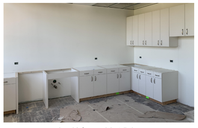
Level 2 Casework Installation